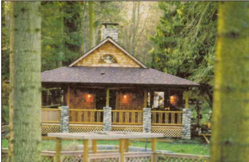
The wraparound porch adds more than 400 square feet to this 1,015-square-foot home. Turning the house plan 180 degrees gave the Brumenschenkels what they wanted - living rooms and a porch facing the view.

R ICHARD AND DIANE BRUMENSCHENKEL SIMPLIFIED their lives in a big way, moving from a 3,600-square-foot house on Lake Whatcom near Bellingham where they had raised three sons, to a 1,015-square-foot house they built themselves on Marrowstone Island near Port Townsend.