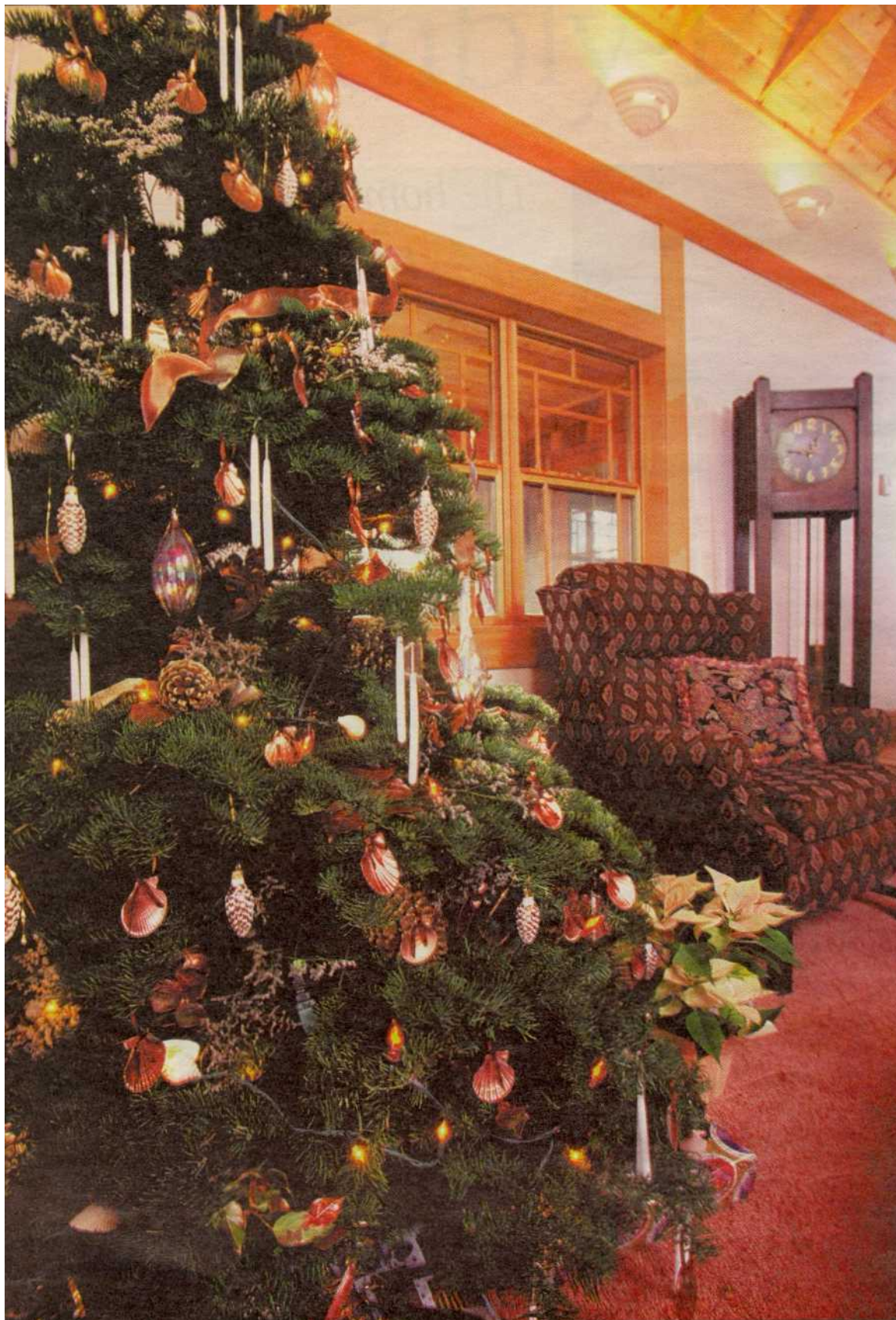
Hand-dipped white candles from a local factory combine with locally found foliage and shells to decorate the tree.